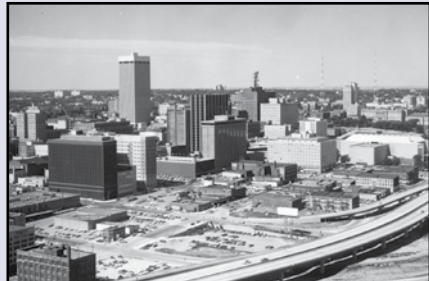
Downtown Omaha, c. 1975.

Using 42 aerial photographs held in The Durham Museum's Photo Archive, the exhibit will highlight the changes to Omaha's architecture and landscape over the passage of the twentieth century. Some objects to be included are several 1915 maps of Omaha highlighting the city's growth and change, cameras used by each of the photographers represented – Louis R. Bostwick, Robert Paskach, and John Savage.